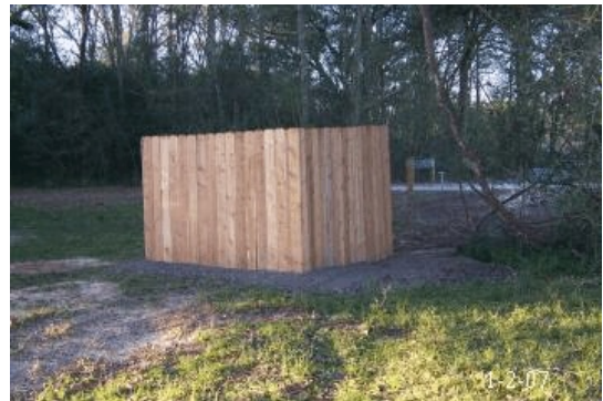
Completed well enclosure