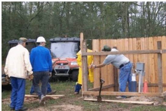
Construction of well enclosure

Put new tops on 7 picnic tables and delivered them to the ADA sites in the camping loops Anchored 7 picnic tables to the pads at the ADA sites in the camping loops Installed rope lights in the stair well at the Nature Center Built a fence enclosure at the new Creekfield water well (see pictures) Put crushed blacktop in and around the fence area at the water well