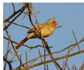
Female Cardinal Jerry Zona, 12/07