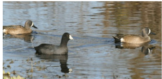
Blue-winged teals and American coot Jerry Zona, 12/07