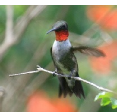
Ruby-throated Hummingbird

http://rickubis.20m.com/hummingbird_081609.wmv