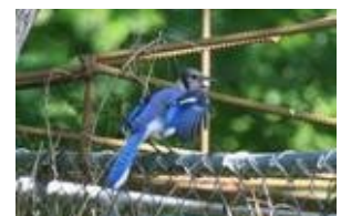
Blue Jay