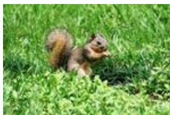
Fox squirrel

Check the websites above for addresses for your Brazoria County and Harris County Legislators and Judges as well.