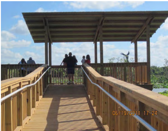
Left: View of new platform on Elm Lake