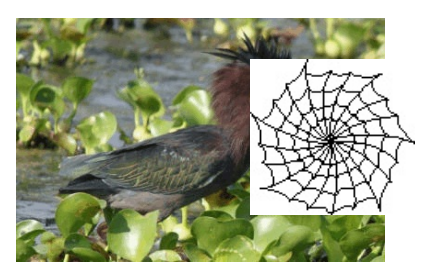
. . After he got mad