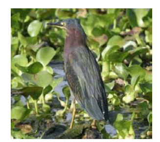
Before he got mad. . .

I finally get to see the <u>green</u> on this Little Green Heron! This guy evidently got mad at me for taking pictures of him, because he puffed up the feathers on his head and walked away!