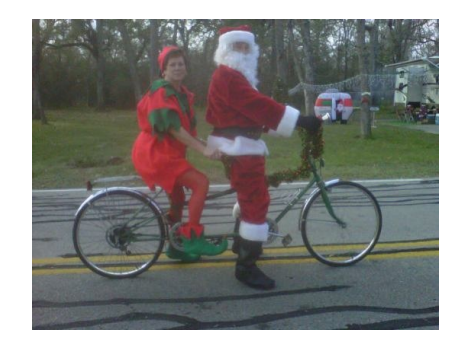
Santa and an elf visit the campground on Christmas Eve.