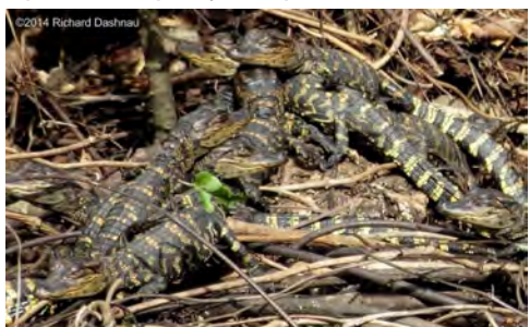
Gator babies: Photo courtesy Rick Dashnau

Clouds began covering the sky about 12, so I packed up my scope and moved to 40 Acre Lake.